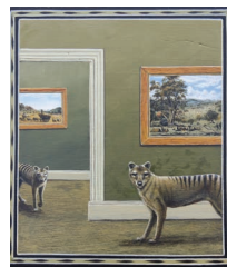
Michael McWilliams After hours 2010 Acrylic on panel, 18.5 x 16.1 cm, private collection