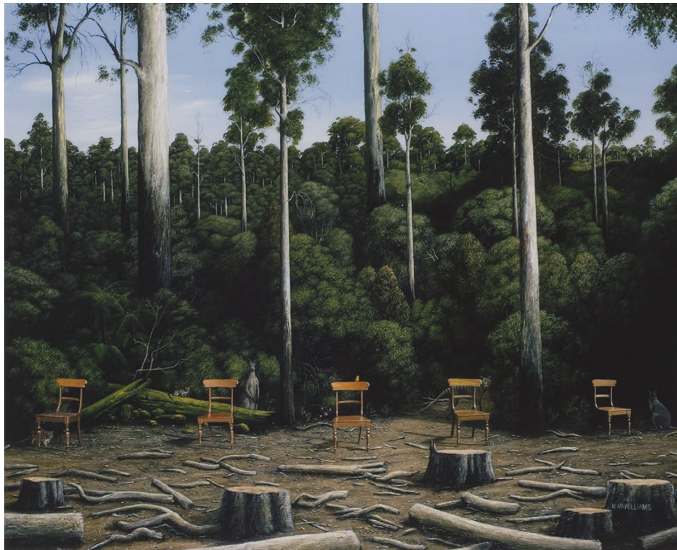
Michael McWilliams Taking a stand 2009 Acrylic on linen, 100 x 120 cm, private collection

This painting of McWilliams' work, containing repeated metaphors and symbols, is a good example of how McWilliams uses them in his work to present an idea or tell a story. In the foreground of this painting you can see the stumps of trees that have been cut down. Five timber chairs line the edge of the native old-growth forest behind. From behind the chairs, we can see the forest's native inhabitants peeking out at us.